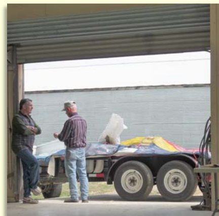
“Think it will be windy at PATE this year?”