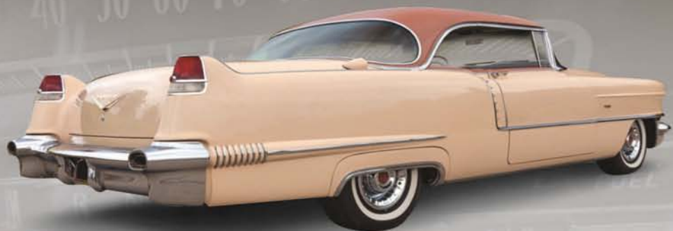
1956 Cadillac Series 62