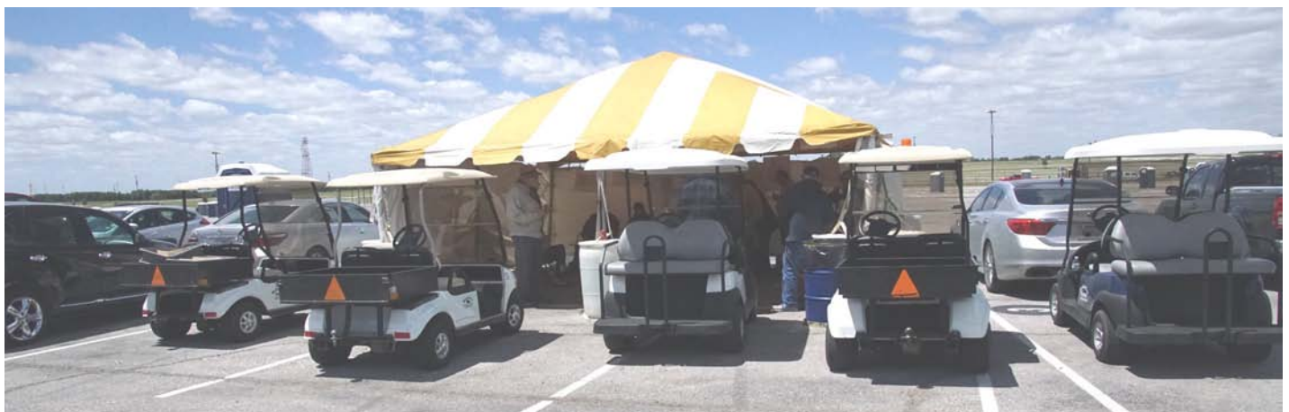
Tear Down Day—workers and golf carts readied for the mission of recovering 9000+ tiles and 133 street signs. Due to careful planning and organization, it gets completed in records time.

There is nothing like arriving early in the morning by Gate 4 of the Texas Motor Speedway and greeted by 42 tubs of vendor space-marking tiles, 133 street sign units, and a few sweets to get the day moving. After an orientation by NTXCLC Pate Swap Meet Director, assignments of duties and the issuing of eight golf carts, instructions on walki-talkies, and issuing of maps and tubs, the setup day begins. Using the new parking lot markings, we usually finish up at about 3:00 p.m. with some minor work left for the next week. All in all, it is a good work effort and a lot gets done.