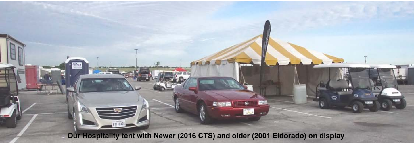
Our Hospitality tent with Newer (2016 CTS) and older (2001 Eldorado) on display.

The NTXCLC Hospitality Tent serves as a warm spot to greet current members, new prospects, old friends, and anyone interested in Cadillacs. We always have a seat to rest weary swap meet deal-hunting feet, and a beverage to quench a thirst.