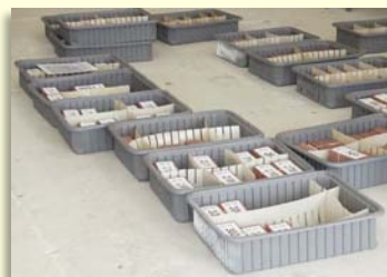
Here some of the 42 tubs full of new tiles ready to go.

A big thank you for all the club members that helped make the PATE Swap Meet the almost biggest in the U.S.A. Clubs included the North Texas Region Cadillac & LaSalle Club, North Texas Region Horseless Carriage Club of America, and the Lone Star Model T Ford Club