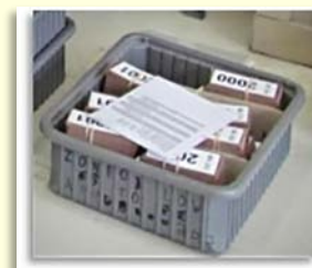
Each tub contains tiles for specific blocks and a laminated map for exact tile count and field position